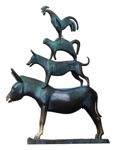
Bremen Town Musicians

We are very much looking forward to seeing you in Bremen!