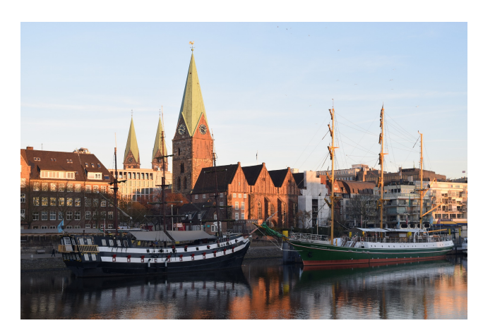
River Weser and Schlachte

As we want to encourage our students to become also researchers in mathematics education, we offer the attendance at the