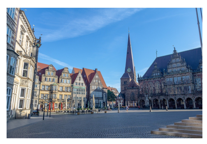
Marktplatz, Town Hall, UNESCO World Heritage

The final registration for MAVI26 ends on August 25, 2020 . To register, please send an email to <u>registration.mavi26@uni-bremen.de</u>. If you have been pre-registered, you do not