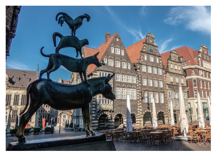
Bremen Town Musicians

Bremen, which dates back around 1,200 years, is much more than just places of interest from centuries past. But it's not just the history what makes Bremen what it is today. The city is shrouded in myth and legend and provides the setting for many a fairytale and true story as well. The guided tour of Bremen city center enables you to discover a world of folklore, fantasy, and intrigue. (© text: BTZ Bremer Tourismus Zentrale)