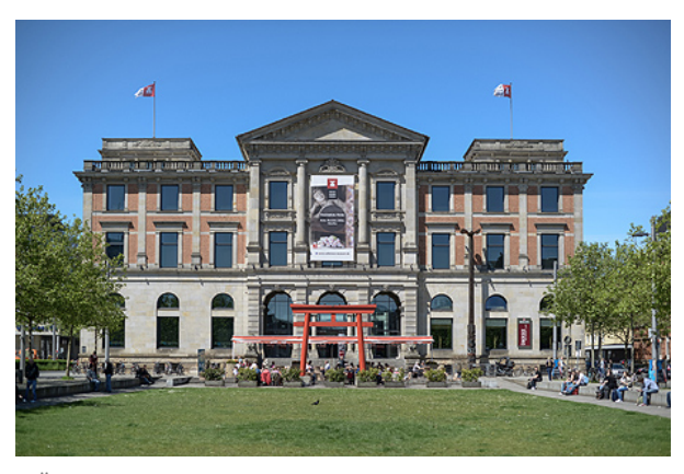
Übersee-Museum Bremen

The Übersee-Museum Bremen is unique within Europe: Distant continents have always fascinated both travelers and those who stay at home. In the Übersee-Museum you can immerse yourself in life on distant continents and find out more about their fascinating cultures and natural environments, with unique exhibits from across the world, superb animal dioramas and real plants. (© text: Übersee-Museum)