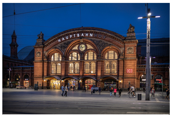
Central Station

You can buy a ticket in the tram or at the Airport tram stop (look for a blue vending machine). One ride is 2,85 €.